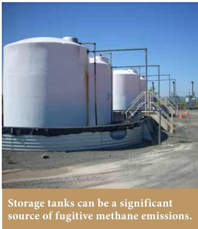
Storage tanks can be a significant source of fugitive methane emissions.