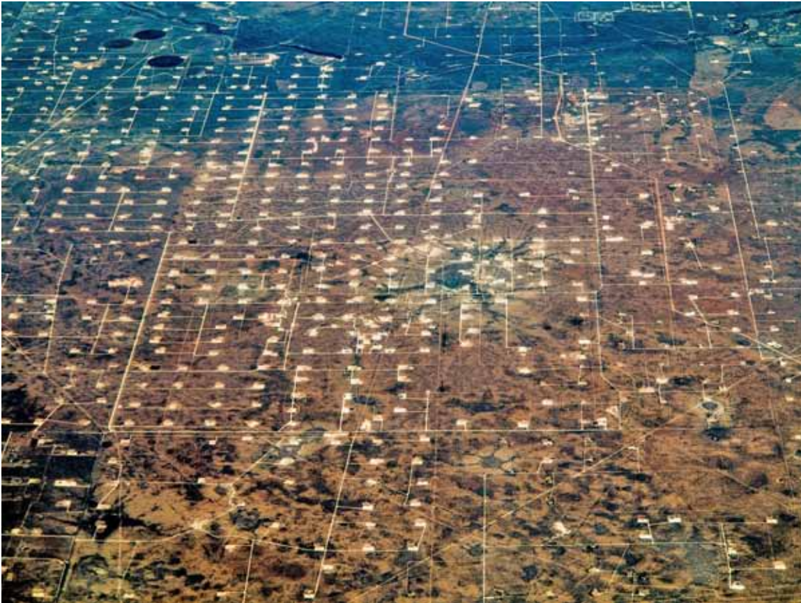
A grid of drilling sites and roads, similar to those used in fracking, lies across the landscape near Odessa, Texas.

In the years to come, fracking may affect a much bigger share of the landscape. According to a recent analysis by the Natural Resources Defense Council, 70 of the nation's largest oil and gas companies have leases to 141 million acres of land, bigger than the combined areas of California and Florida. 113 More-